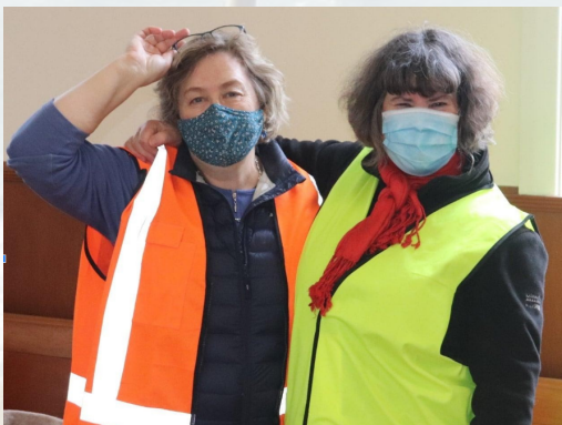
Our lovely volunteers working hard during the Afghan Evacuees Appeal